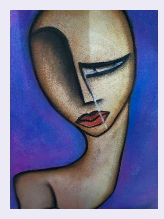
Artwork: Mastaneh Azarnia

The Albanese Government, like those before it, has chosen to spend millions of dollars not on protecting the human rights of all or supporting people who sought safety, but instead on funding an empty detention centre in Nauru and maintaining a cruel system for political gain.