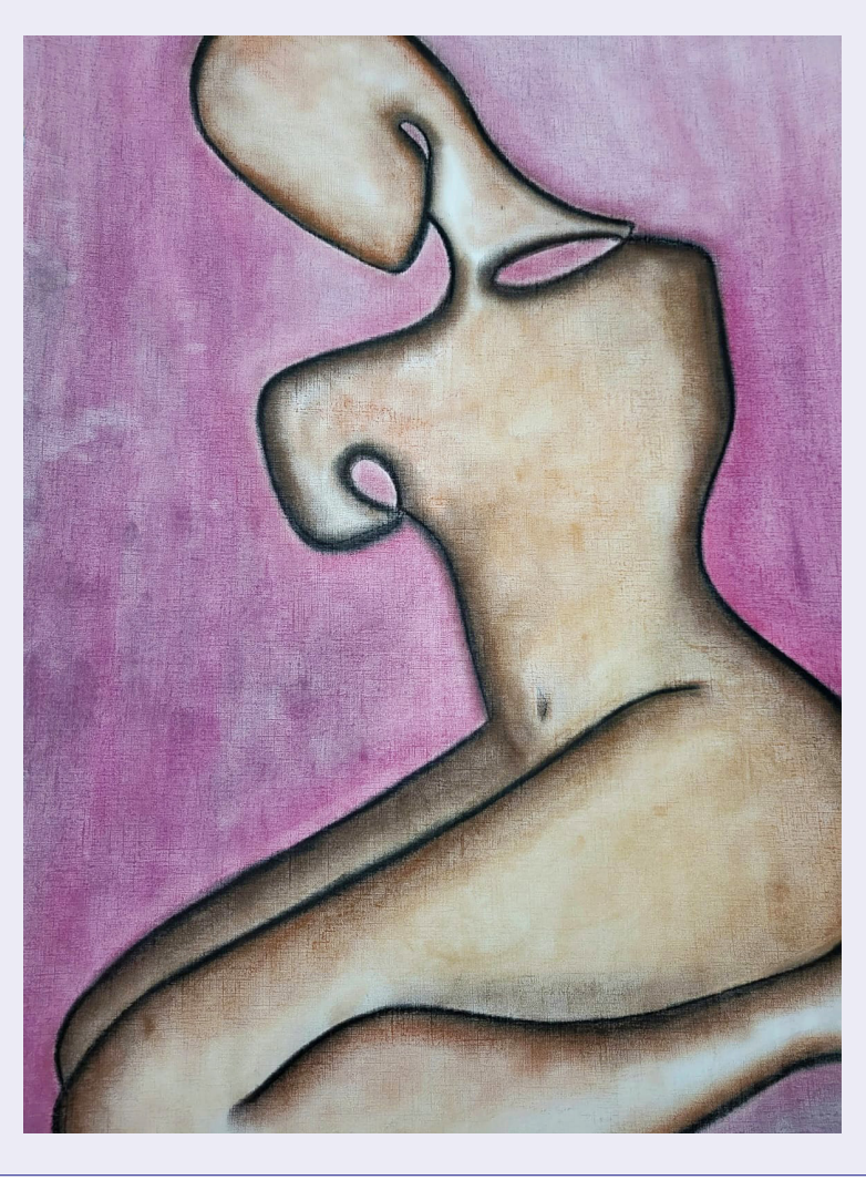
Artwork: Mastaneh Azarnia

The Nauru Files only covered less than three years out of the decade of offshore detention and were only from Nauru, yet provided a glimpse into a cruel and terrifying system.